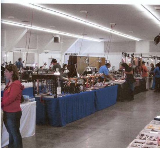
A couple of views of the west part of the room during the show