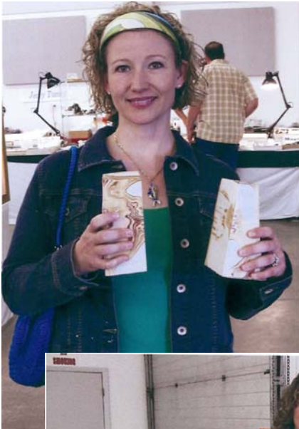
Winners of the grand prizes— The young lady on the left who got the bookends and books was on her way back to Utah after a visit. And the smiling blond girl on the right was awarded the beaded snowflake obsidian necklace.