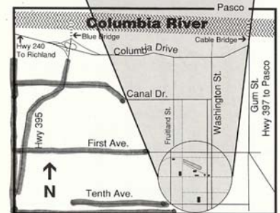
Map of Kennewick, Washington