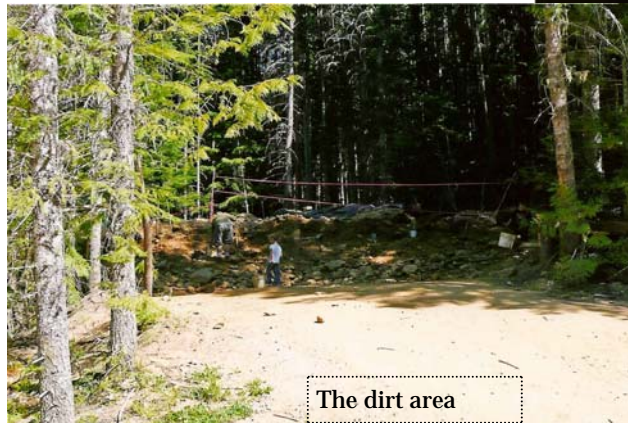
The dirt area